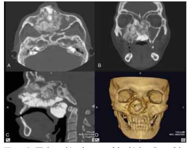
Figure 3. CT showed involvement of the third medium of the face.