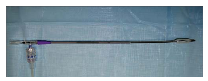
Figura 3. Balloon catheter.

In patients with involvement of the three groups of paranasal sinuses (maxillary, frontal and sphenoidal) we recommend the start of procedure with AP image, for the performance in the maxillary and frontal sinuses. After their dilation, we recommend the use of profile image for identification and dilation of the sphenoidal sinus ostium (3).