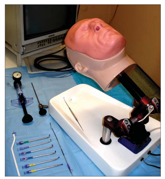
Picture 5. Equipment for balloon dilation Relieva Sinus Balloon Catheter System (Acclarent, INC, Menlo Park, California) and functional endoscopic surgery simulator model - Sinus Model Otorhino-Neuro Trainer (S.I.M.O.N.T.) (Prodelphus, Brazil).