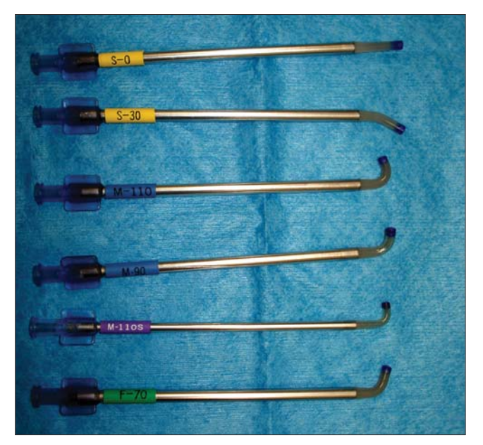
Picture 1. Available guide-catheters. There are several angulations for the different paranasal sinuses. S-0 and S-30 for sphenoidal sinus; M-110 and M-90 for maxillary sinus; M110S for pediatric maxillary sinus; F-70 for frontal sinus.

microfractures that end up remodeling the anatomy, dilates the ostia and allows a PNS normal aeration without, however, the removal of the tissues and damage to the nasal mucosa. This makes this procedure still less invasive than the consecrated FES (6,7).