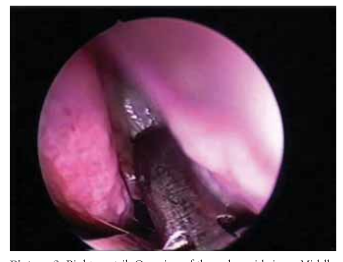
Picture 3. Right nostril: Opening of the sphenoid sinus. Middle infundibulum on the right, nasal septum on the left and opening of the sinus with the help of a nipper in the center.