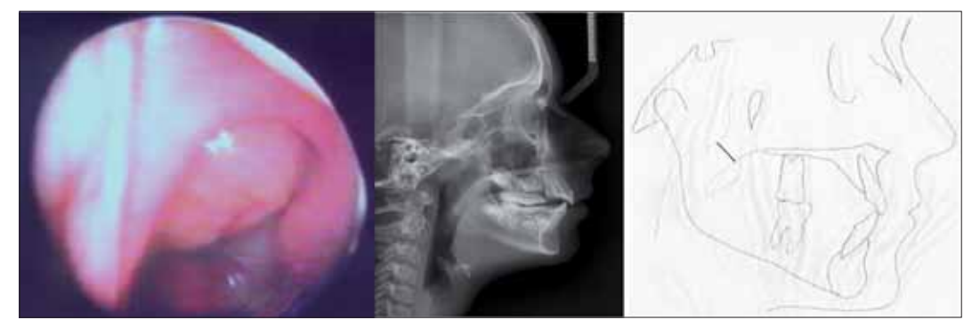
Figure 2. Grade 2 hyperplasia of the pharyngeal tonsils by nasofibropharyngoscopy and cephalometry (cephalometric analysis).