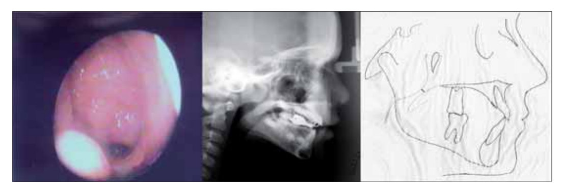
Figure 4. Grade 4 hyperplasia of the pharyngeal tonsils by nasofibropharyngoscopy and cephalometry (cephalometric analysis)

• Grade 4 – tonsil in contact with the torus tubarius, vomer, and the soft palate at rest (Figure 4).