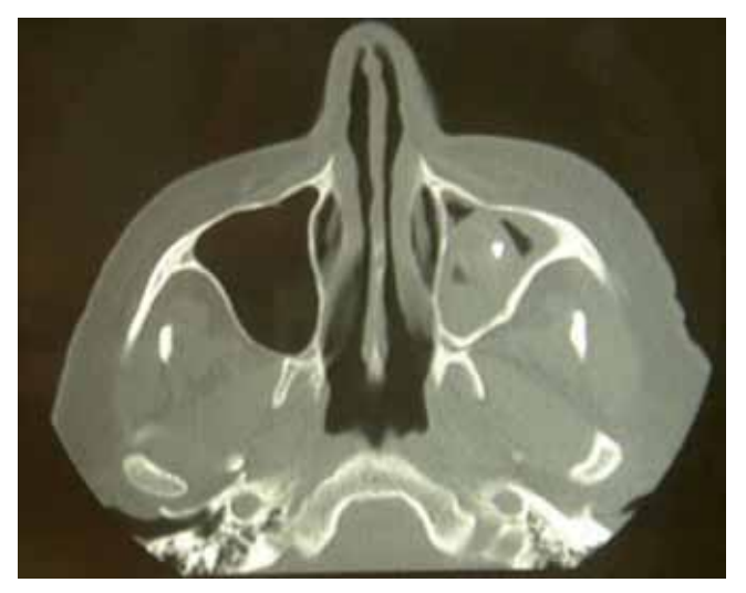
Figure 2. TC of face presenting thickening of the mucous covering of the maxillary sinus left and mass of density of soft parts with calcifications.