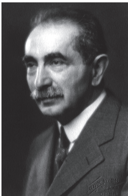
Figure 6. Gustave Bondy (1870–1954), Austrian surgeon (University of Vienna), popularized the modified radical mastoidectomy in which some or all of the middle ear structures were preserved in order to attempt to preserve hearing.

In order to release the purulent secretions confined within the antrum and the attic, Bondy removed the bone up to the external wall of the attic. He intended to preserve the tense part of the tympanic membrane and, if possible, the ossicles. A meatal skin flap was used to seal the defect between the epitympanum and mesotympanum; alternatively, when the ossicles were preserved, the flaps could be used to cover the exposed bodies (49-51).