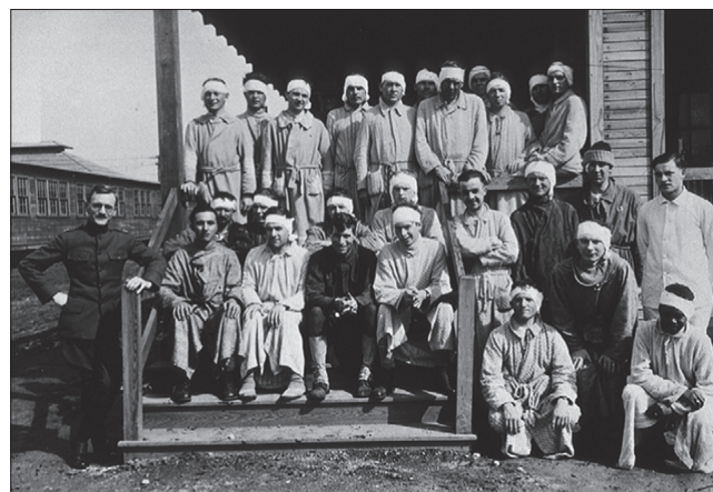
Figure 2. "Mastoid Club"—Picture from the time of the first World War illustrating how frequently mastoidectomies were performed. (Sander and colleagues, 2006).

The first documented surgical incision to drain an infected ear was described by the French physician Ambroise Paré in the 16 th century (8-11). Paré is credited with recommending drainage to François II, King of France, in 1560 (12). The king died of ear infection soon after; he did not undergo surgery because his mother, Catherine de Medicis, would not allow it (13).