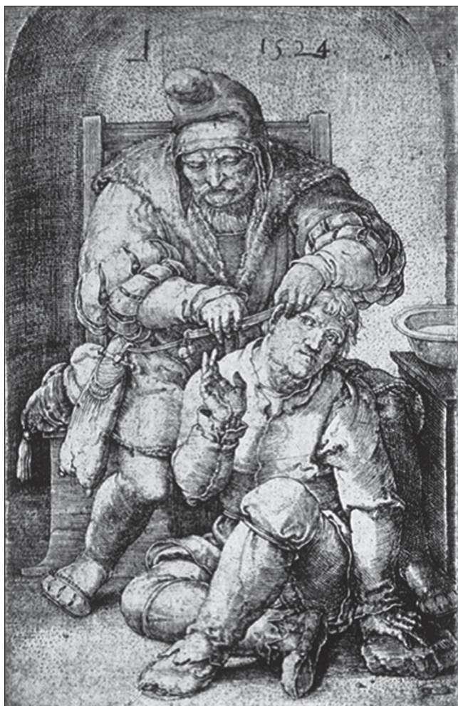
Figure 1. Early mastoid surgery as performed by a barber surgeon. Incision to drain abscesses has been practiced since ancient times. Lucas van Leyden, 1494–1533; The Surgeon , 1524.