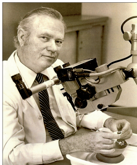
Figure 7. William House. American surgeon who introduced modern techniques of mastoidectomy and the use of mastoid access in otoneurosurgery.

Mastoidectomy continues to be a life-saving surgical procedure.