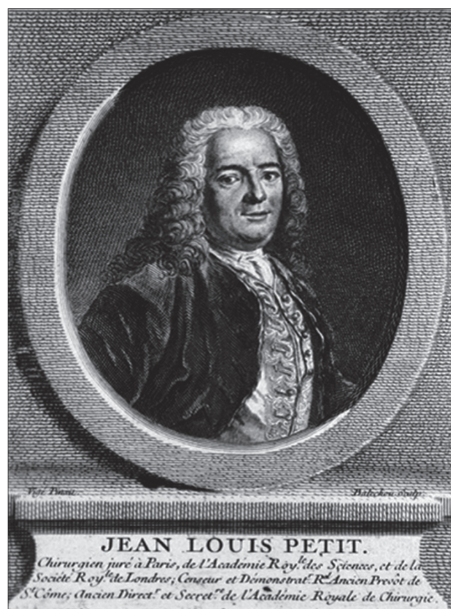
Figure 3. Jean Louis Petit (1674–1750). French surgeon who was the first to formally describe opening the mastoid, in a text published posthumously in 1774.

this period, he created a type of tourniquet for which he became famous. This was applied as a “screw tourniquet” and was used to contain hemorrhage before and after surgical procedures. Petit is credited with a level of expertise in mastoid surgeries unequalled in his time (17).