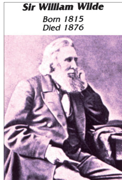
Figure 5. Irish surgeon who popularized the retroauricular incision.

Interest in mastoid surgery did not fade completely in the early 19th century. However, most surgeons performed mastoidectomy only in certain situations and for specific indications. In 1838, J. E. Dezeimeris wrote that reports describing complications due to mastoidectomies should be collected before the procedure was definitively