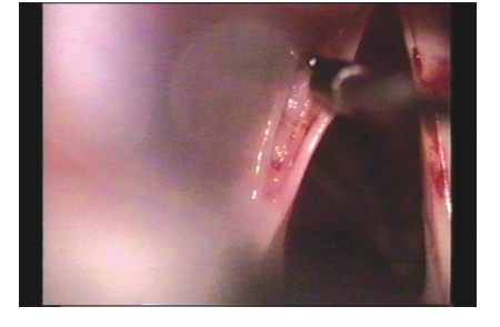
Picture 5. Performing of the transversal sections in the vocal ligament.