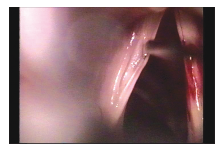
Picture 2. Medial displacement of the mucous sulcus of the free edge.