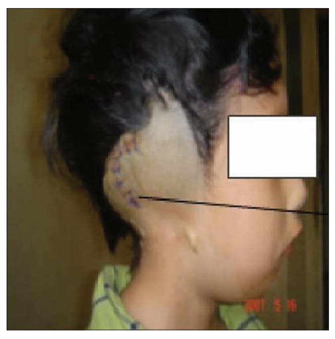
Fig. 3. Postoperative photo of the patient showing sutured site.