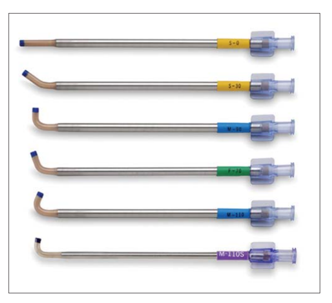
Picture 2. Semi-flexible guide-catheters of several angulations.

The first works published sought to evaluate the feasibility and the safety of the use of balloon in the practice.