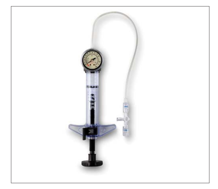
Picture 3. Device to inflate balloon.